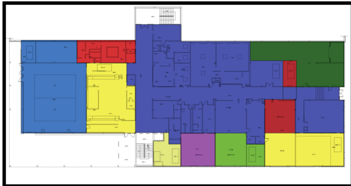
Classroom Bldg. Lower Floor Zoning