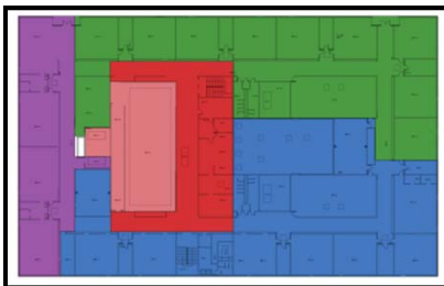
Classroom Bldg. Upper Floor Zoning