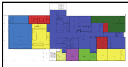
Classroom Bldg. Lower Floor Zoning